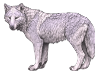
Cool Light II