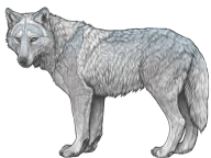
Cool Light III