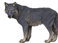
Cool Medium II