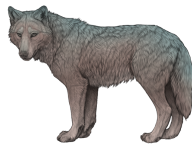
Cool Medium I