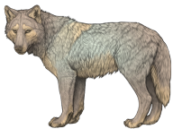
Cool Light II