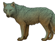
Cool Medium II