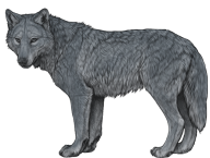
Cool Medium II