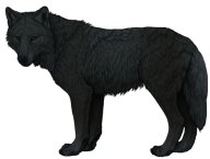
Cool Dark III