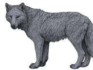
Cool Medium I