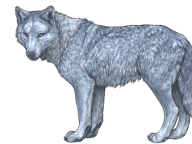
Cool Medium II