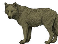
Cool Medium I