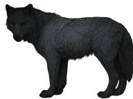
Cool Dark II