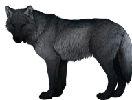
Cool Medium III