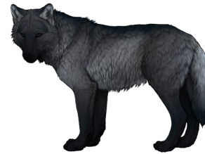
Cool Medium III

The possible genetics resulting from this breeding are listed below. These results are listed in alphabetical order and not based on probability.