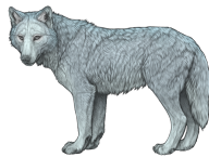
Cool Light I