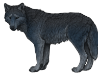
Cool Dark II