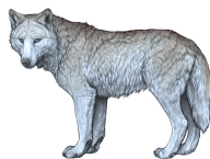
Cool Light I