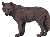
Cool Dark II