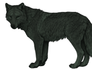
Cool Dark I