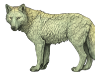
Cool Light I