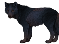
Cool Dark III