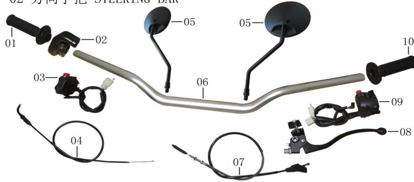
F-02 方向手把 STEERING BAR