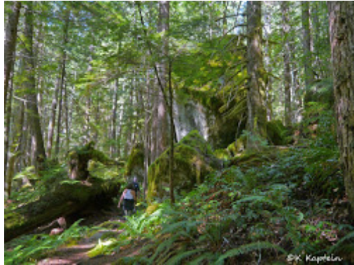
Upper Myra Falls Trail