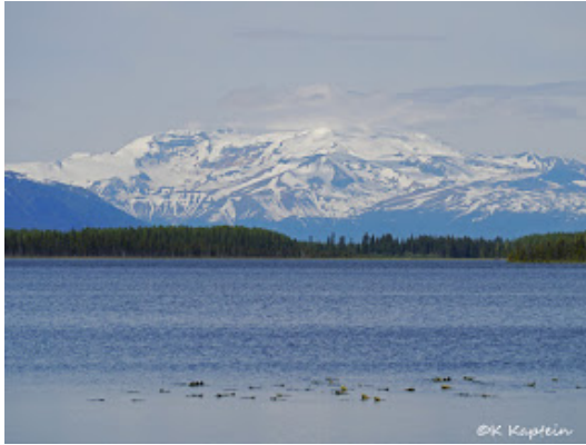
Mt Edziza from Morchuea Lake