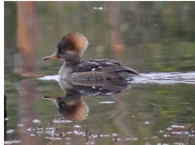
Hooded Merganser female