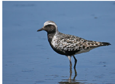
Black-bellied Plover