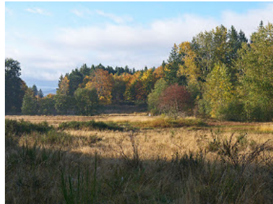
Mallard Creek headwaters meadow