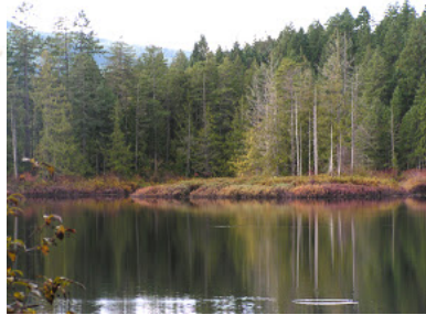
Maple Lake: Krista Kaptein photo