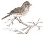
Purple Finch: Bill Heybroek drawing