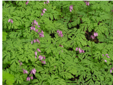
Pacific bleeding heart