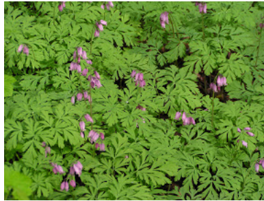
Pacific bleeding heart