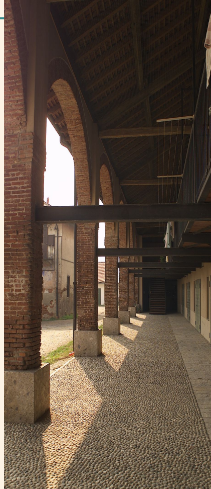
Increa farmhouse A relic from the Renaissance