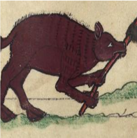
"Book of Hours, Boar digging grave, from a marginal cycle of images of the funeral of Renard the Fox, Walters Manuscript W.102, fol. 80v detail" by Walters Art Museum Illuminated Manuscripts is marked with CC0 1.0