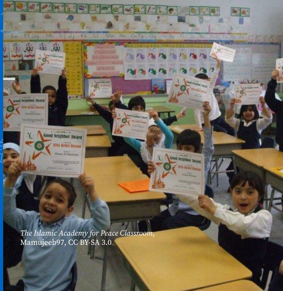
The Islamic Academy for Peace Classroom