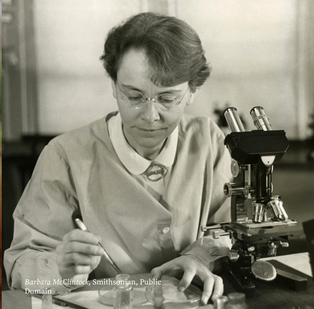
Barbara McClintock