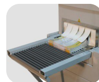
Optional exit conveyor