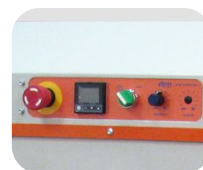
Precise temperature and speed control panel