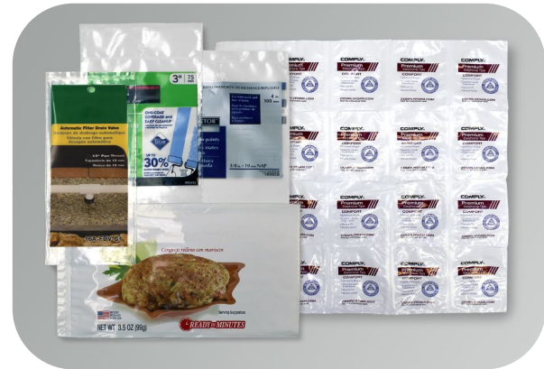
Custom printed rollbags can be configured with a variety of features to create the perfect bagging solution for all products