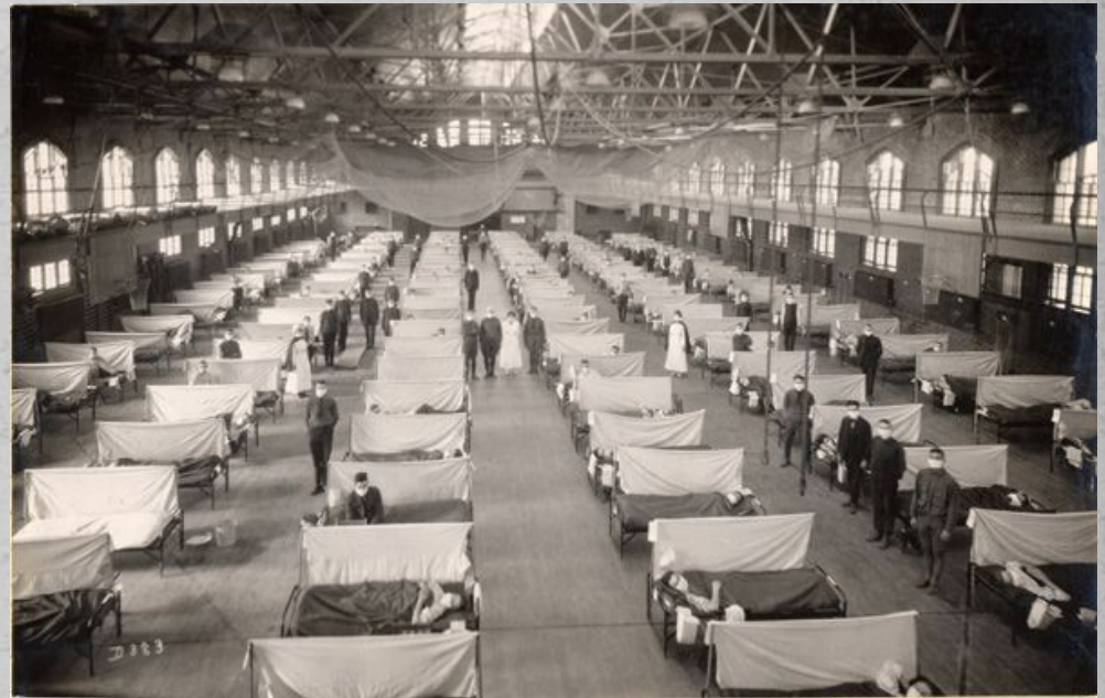
A converted gym at Iowa State University, treating flu patients. At least 53 people at Iowa State died during the flu epidemic.