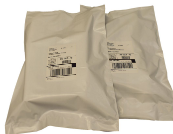
Ideal for bagging soft goods, apparel, and other items shipped in coex poly mailers

Specifications subject to change without notice