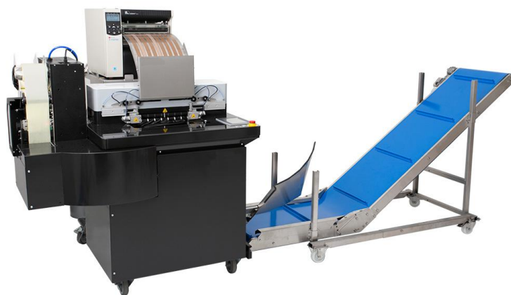
The R3200 Fulfillment can be equipped with a packing slip printer with , inclined outfeed conveyor, as well as other facility-specific options