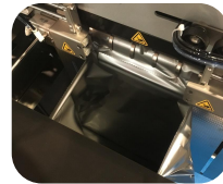
Easy load bag opener squares open and grips the bag