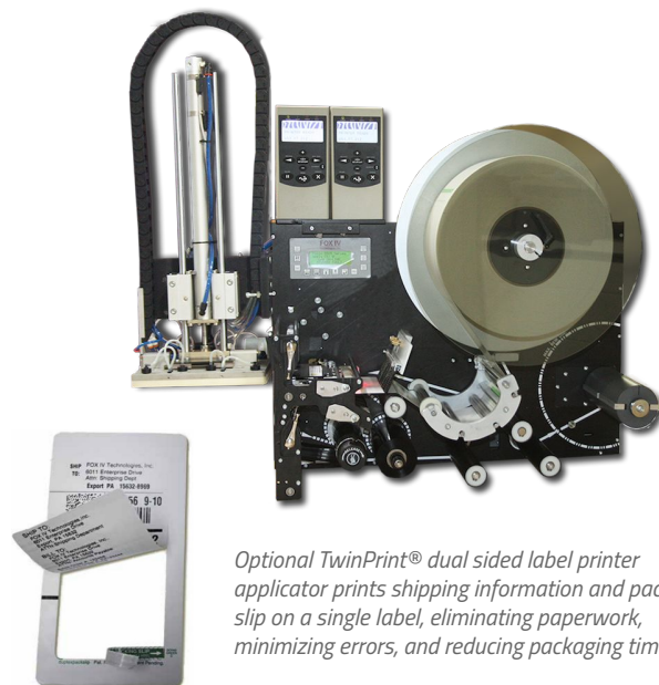
Optional TwinPrint® dual sided label printer applicator prints shipping information and packing slip on a single label, eliminating paperwork, minimizing errors, and reducing packaging time.

* Dependent on bag size, thickness, product, and printing