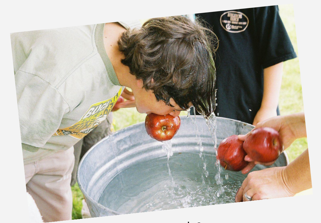
Bobbing for Apples