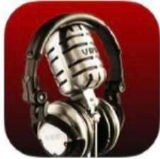
Voice Record Pro for iOS (FREE)