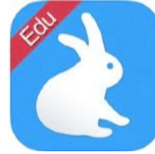
Shadow Puppet EDU for iOS (FREE)