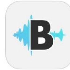
AudioBoom for iOS & Android (FREE)