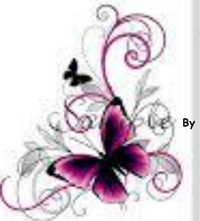
By: Y. Agus Supriyanto