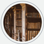
Oregon Social Science