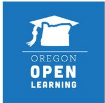
Oregon Open Learning