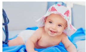
Baby - Today's Parent todaysparent.com