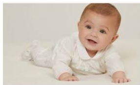
Newborn Baby Essentials List | Mothercare mothercare.com