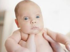
Baby name ideas: Worst names for ba... news.com.au