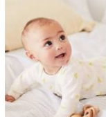
Newborn Baby Clothes... boden.co.uk