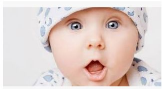
Northants Baby & Toddler Show Tickets ... eventbrite.co.uk