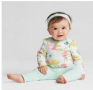
Baby Girls' 3pk Pants Cloud I... target.com