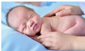
Gently stroking babies 'provides pain ... bbc.com