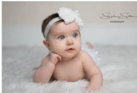
Baby Photography stephensutton.co.uk