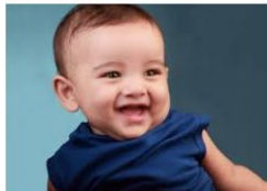
Top 100 boys names in 2018 | Baby bo... bounty.com