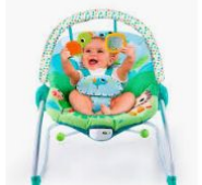
Bright Starts Playful Parade... smythtoys.com