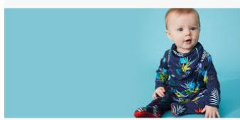
Baby Clothes | Debenhams debenhams.com