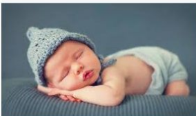
Brain Development ♪ Classical Music ... youtube.com