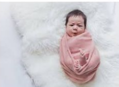
Swaddle Your Baby ... parents.com