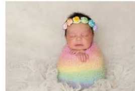
Most-popular baby names of 2019 so far ...