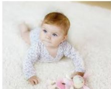
4 Month Old Baby Development - Ch... emmasdiary.co.uk