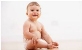
Is my baby about to lose his cute thigh ... theguardian.com