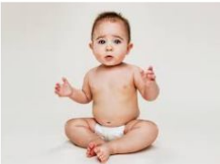
Baby Like Cilantro? These Genetic Tests... wired.com