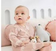
Baby Clothes | Baby Gifts, Sh... next.co.uk