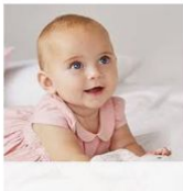
Baby Clothes And Nurser... direct.asda.com