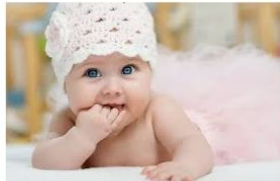
Baby - Netmums netmums.com