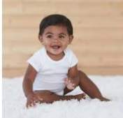
Brand Short Sleeve Bodysui... gerberchildrenswear.com