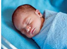
Settling baby: patting settling ... raisingchildren.net.au