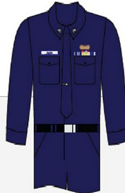
WINTER DRESS BLUE