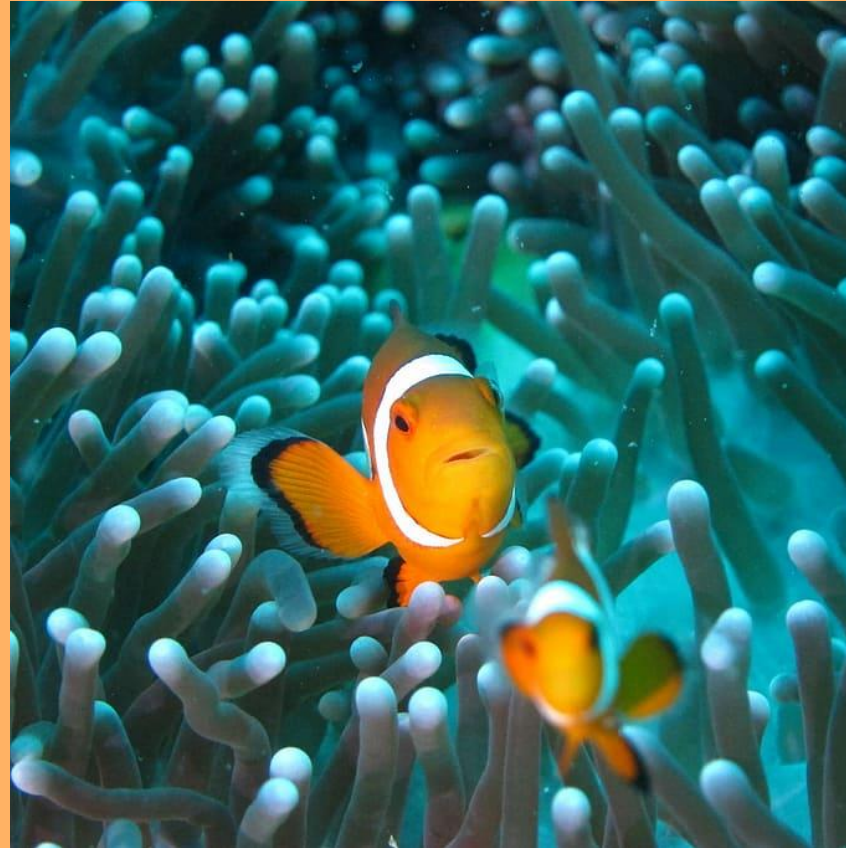
Clownfish and anemone

The symbiotic relationship between the clownfish and the anemone is where the clownfish is given a anemone shelter and the anemone is given food