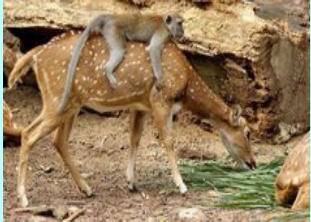
Macaques and deer

The macaques and the deer have a symbiotic relationship in which the deer eat fruit the monkeys drop and also allow the monkeys to groom them, so a monkey jumping on a deer's back is not as freaky as it looks.