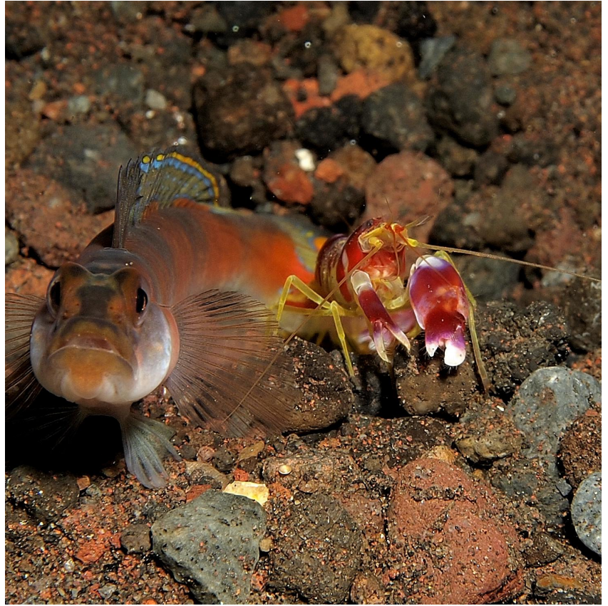
Goby and shrimp

In the goby and pistol shrimp symbiosis, This relationship is not parasitic and not commensal—it is mutual. The shrimp builds and maintains a burrow that both animals live in, and the fish offers the shrimp protection from predators and is the eyesight.