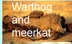
Warthog and meerkat