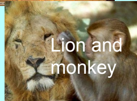
Lion and monkey