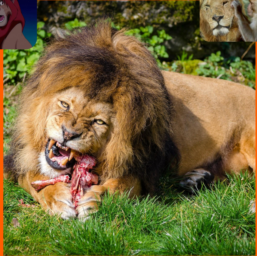
Lion and monkey