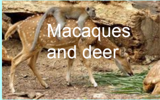
Macaques and deer