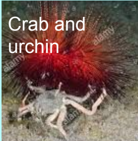
Crab and urchin