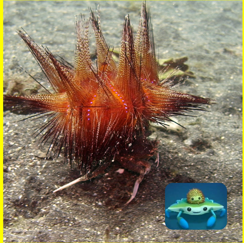
Crab And urchin

The crab and the urchin help each other the crab gives the urchin food and the urchin gives the crab protection