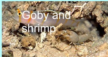
Goby and shrimp