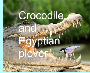
Crocodile and Egyptian plover