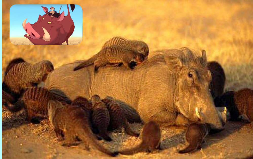
Warthog and meerkat

The warthog-meerkat encounter is a rare example of mammals exhibiting a symbiotic relationship called mutualism, where two animal species form a partnership with benefits for both groups. The warthogs get a cleaning and the mongooses get a meal.