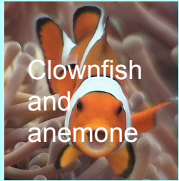
Clownfish and anemone