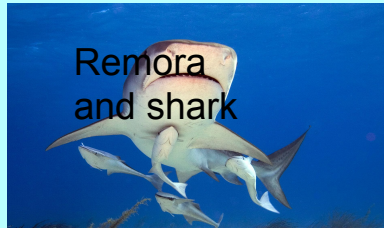
Remora and shark