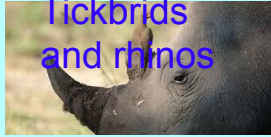
Tickbirds and rhinos