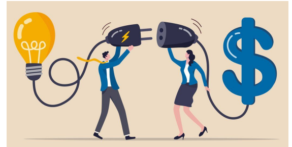
Figure 1: Entrepreneurship