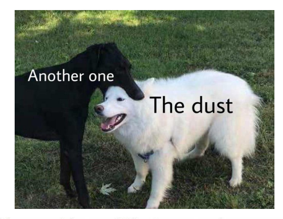
air bud? i havent heard that name in years...