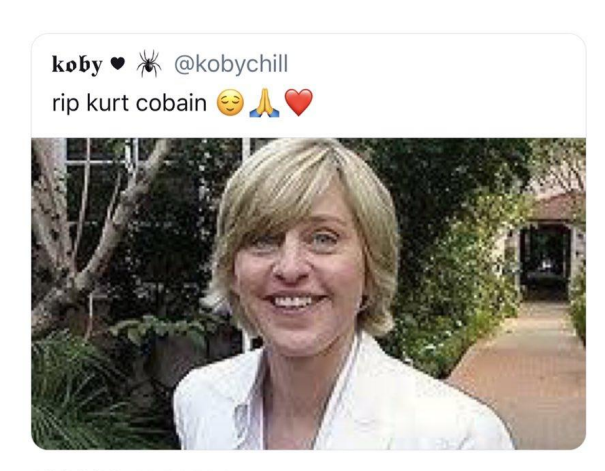
10/12/18, 11:51 PM