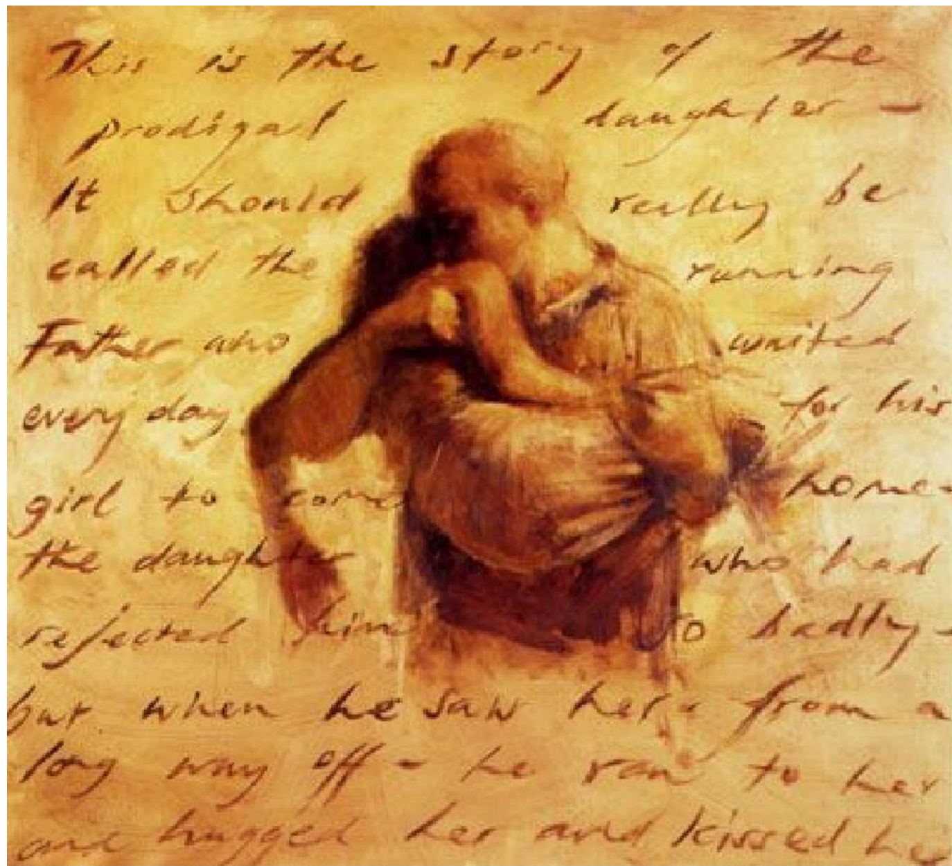
The Prodigal Daughter by Charlie Mackesy