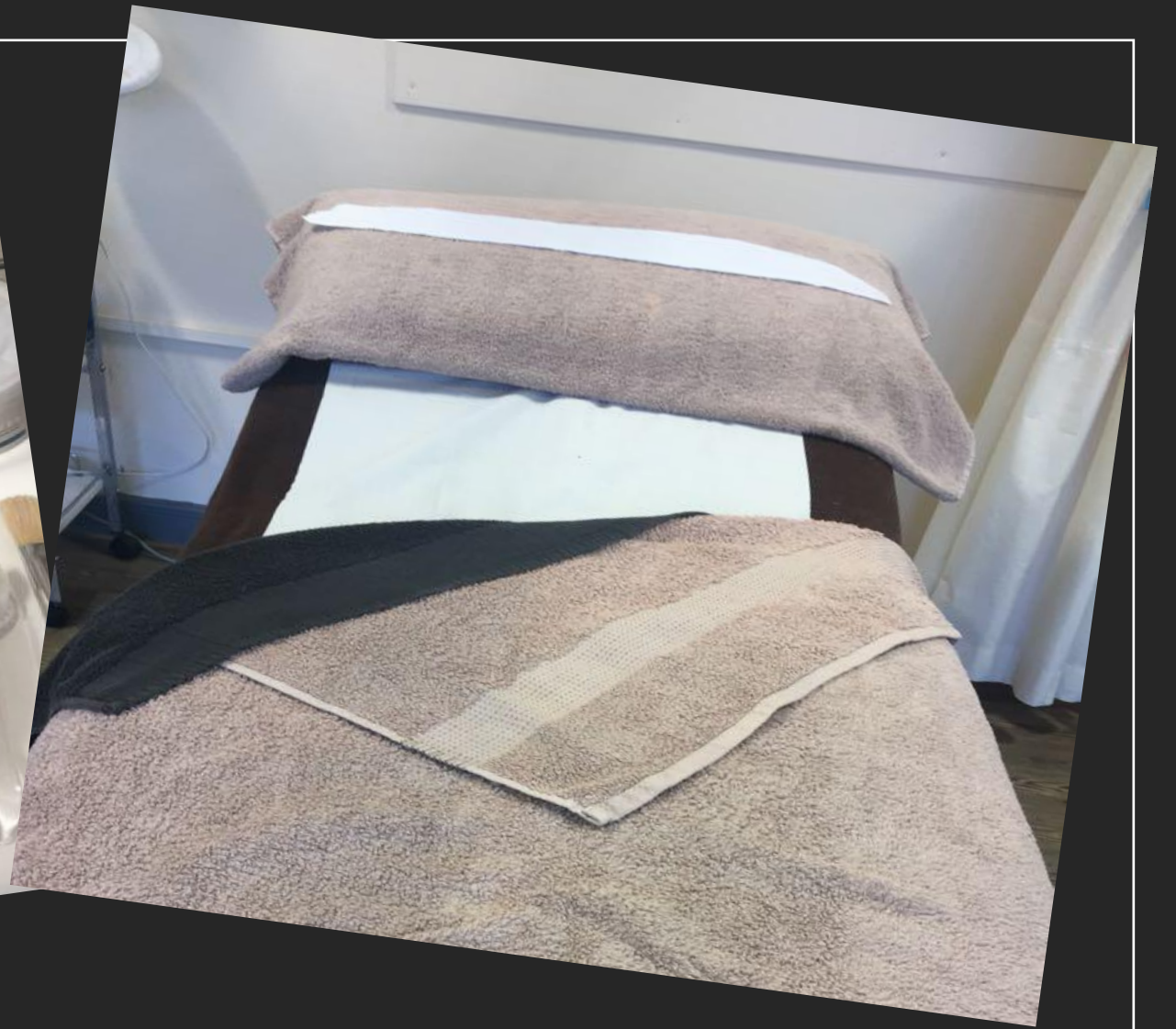
Preparation/set-up for a Facial Treatment.