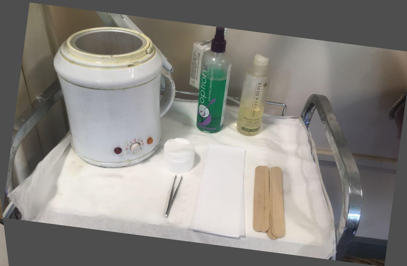
Preparing for a Beauty Therapy Treatment.