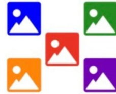
5 Photo Story