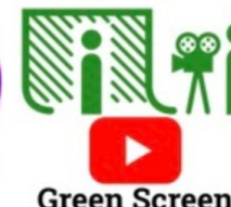
Green Screen Video