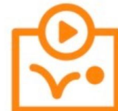
Animation or Game