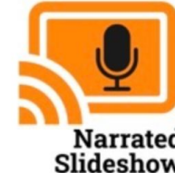
Narrated Slideshow or Screencast