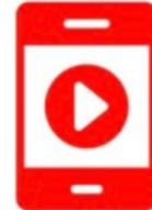
Quick Edit Video