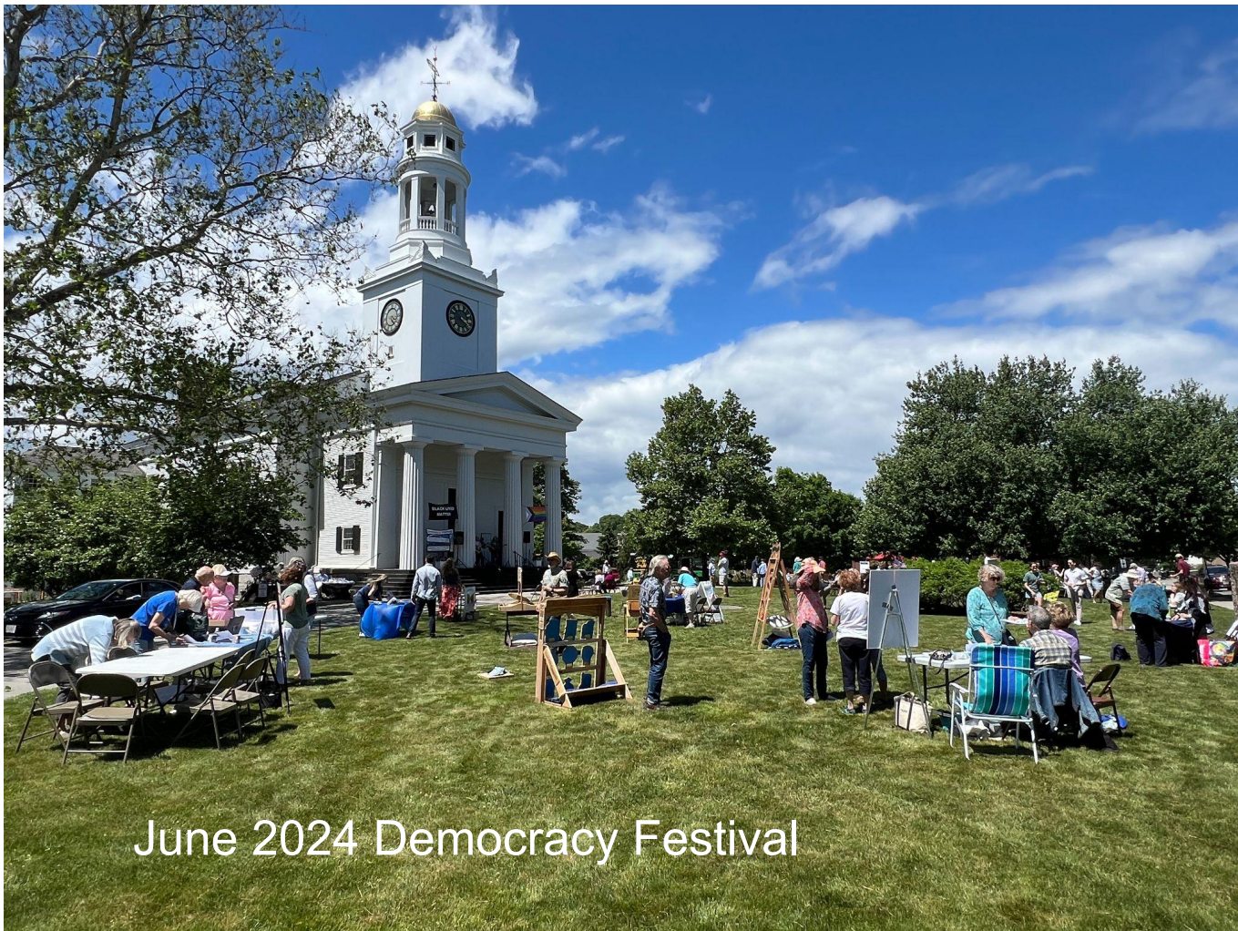
June 2024 Democracy Festival