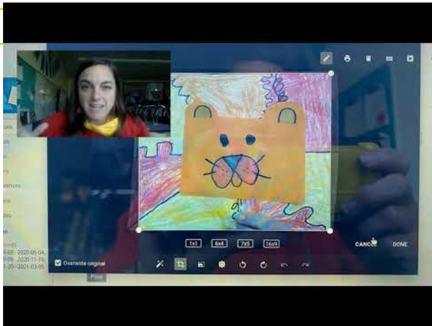
PHOTOGRAPHING WITH A CHROMEBOOK