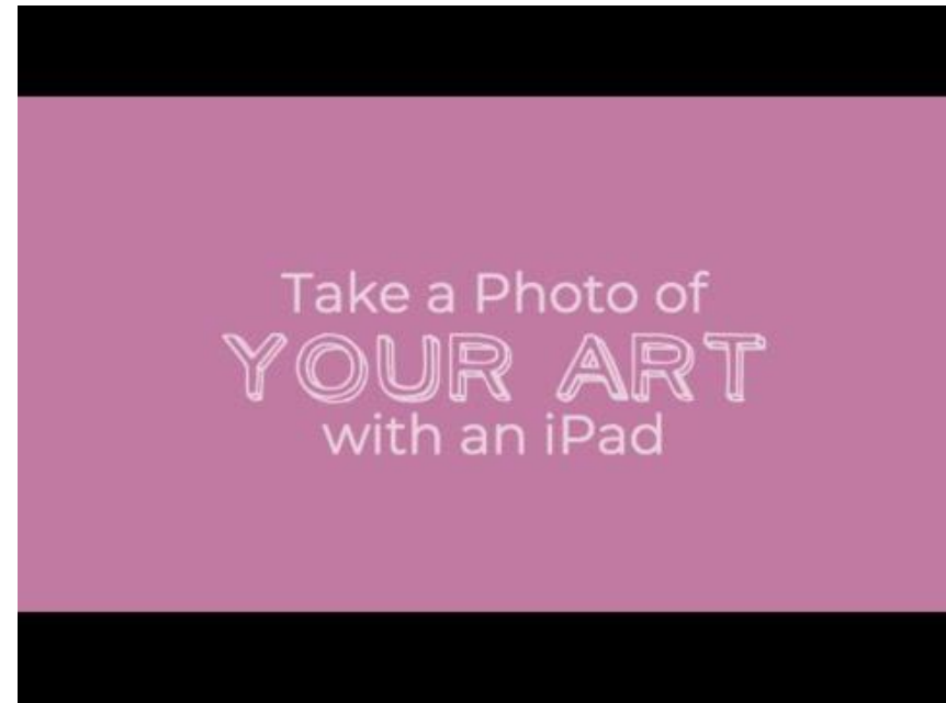
PHOTOGRAPHING WITH AN IPAD