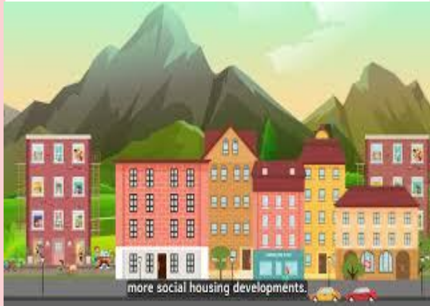
Social Housing video