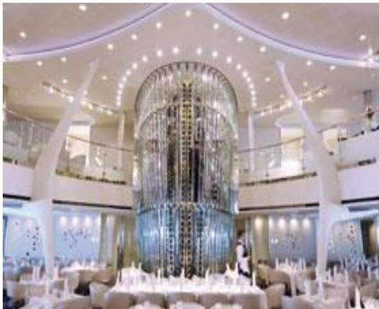
Moonlight Sonata Restaurant

The airy Main Restaurant offers exquisite menu selections, which change nightly to give you a variety of classic and contemporary choices. And the service? Legendary.