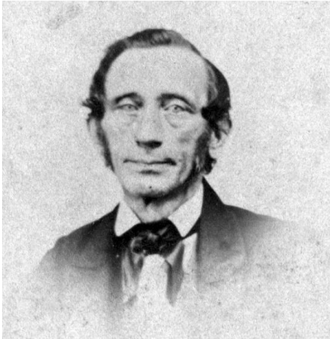
Christian Frederick Martin

Martin's X-brace allowed for the use of steel strings on the modern guitar—which enhanced amplification.