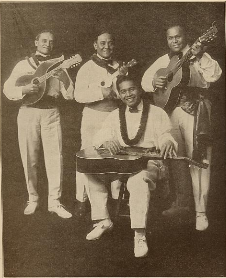
Awai's Royal Hawaiian Quartette

Which delighted thousands during the Panama Pacific International Exhibition at San Francisco in 1915.