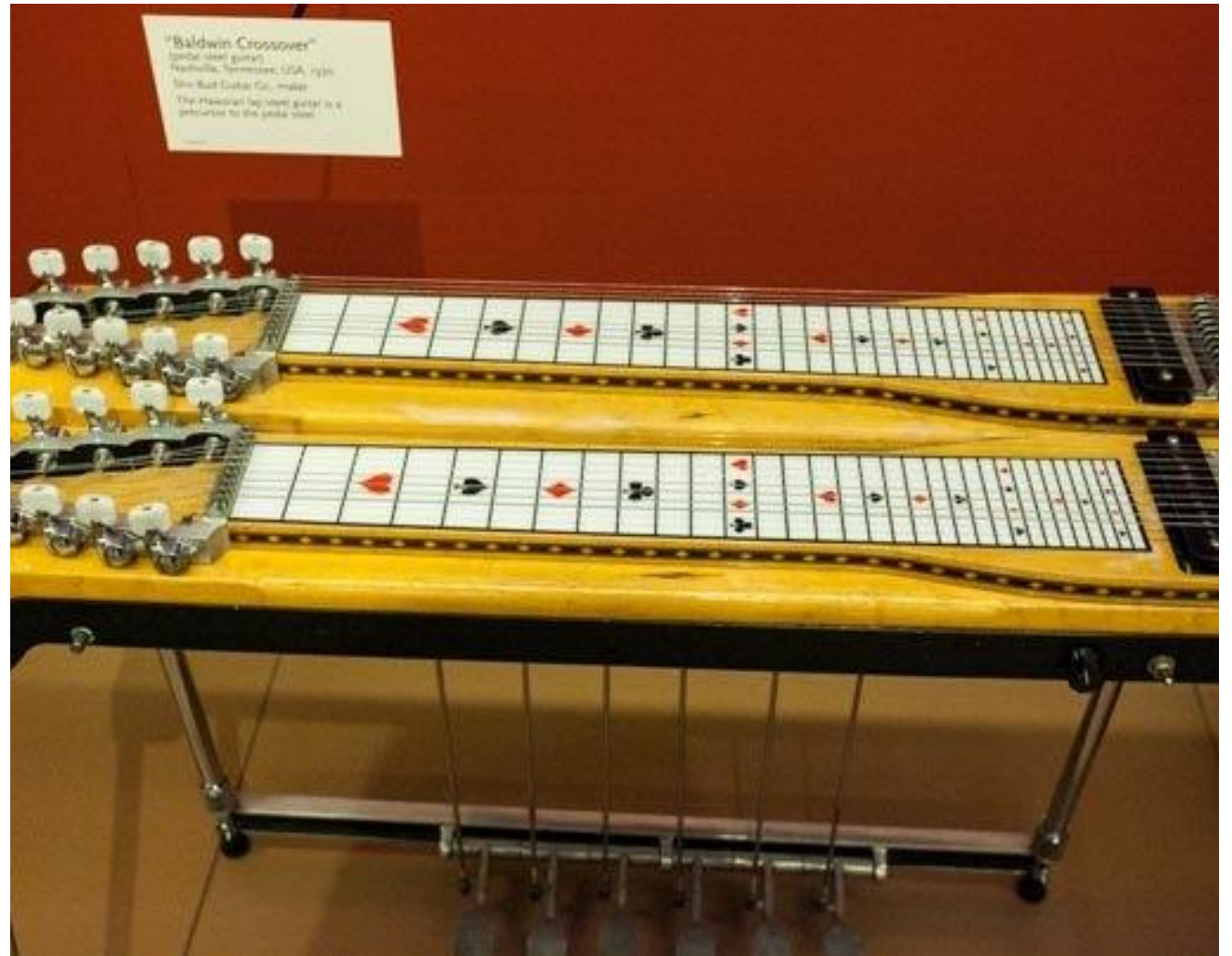
"Baldwin Crossover" (pedal steel guitar) Knoxville, Tennessee, USA, 1930s The Baldwin Crossover guitar is a precursor to the pedal steel

Prominent instrument in country, bluegrass, rock, and other genres