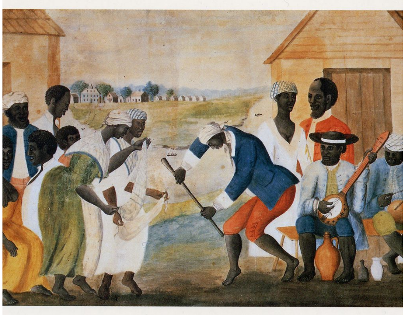
“The Old Plantation” by John Rose c. 1800

This picture shows an enslaved person playing an 18 th century gourd banjo. The banjo is strikingly similar to earlier West African gourd banjos.