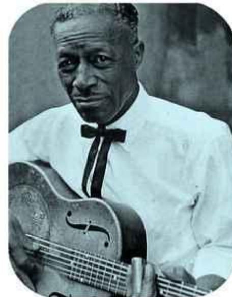
Photo of Son House, from

https://www.discogs.com/pt_BR/artist/313078-Son-House