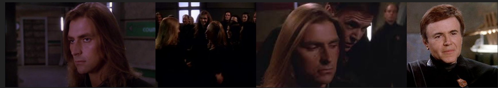
"We all know a human-telepath war is coming."