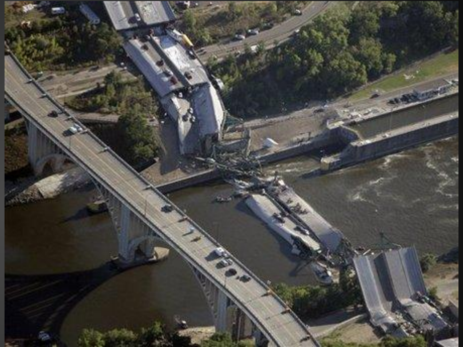
I-35W bridge collapsed in Minneapolis in 2007