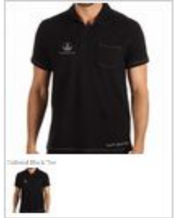
Collared Black Tee

This product has a minimum quantity of 100