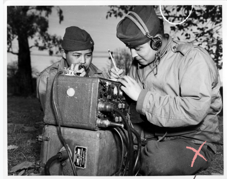
Actual code talkers!

the story of Ned Begay, a fictional man, of the Navajo/Diné tribe. It's about how he started his journey in the most difficult of circumstances, but went on to serve in one of the most important roles in World War II in secret - a code talker for the United States military.