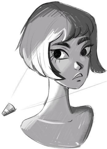
FOCAL / HARD LIGHT