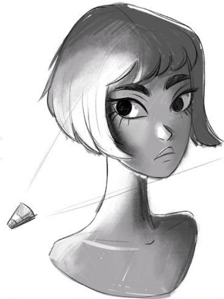
DIFFUSED / AMBIENT LIGHT

Sharp edges High contrast A focused light source