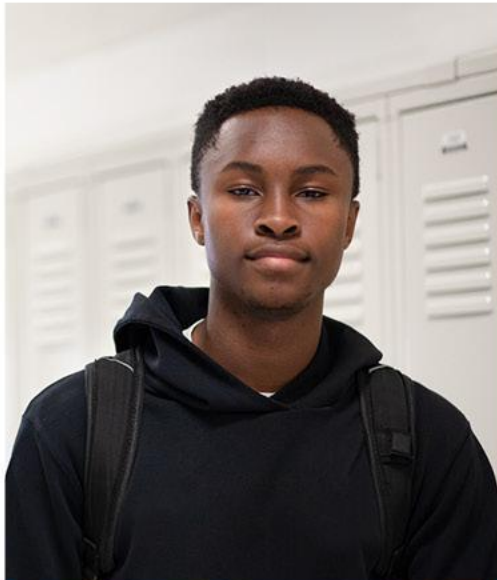
High School Based