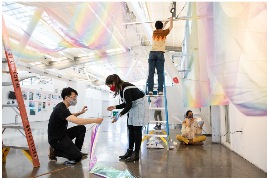
Students collaborate on an installation for the CCA@CCA Fluid Mutualism Symposium in the Nave, spring 2022.