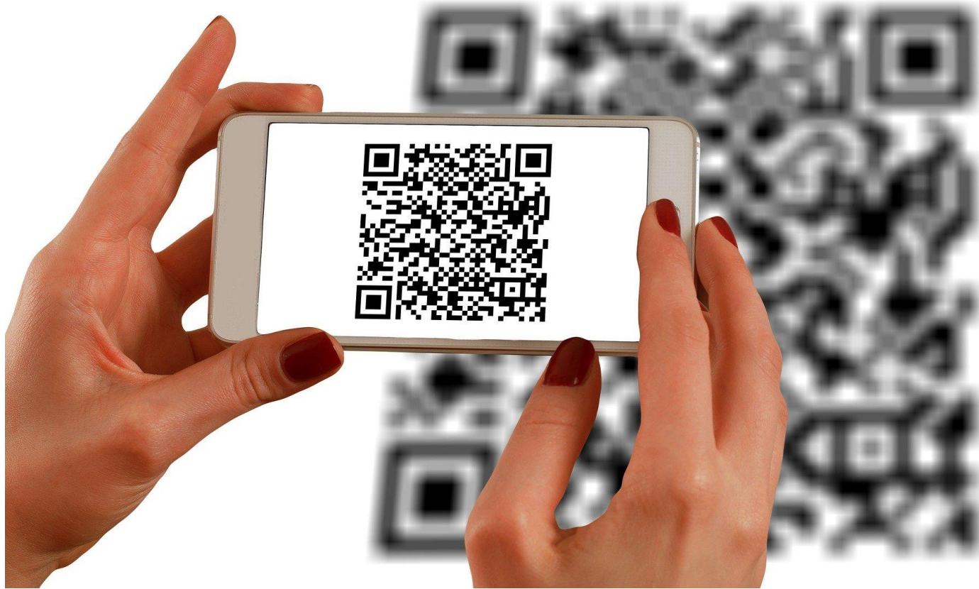
Figure 3.1: Woman with red painted fingernails holds her iPhone up to a QR Code to take a photo of the code.