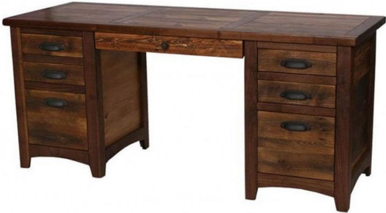
Figure 1.1 Replica of a desk to be used at an exhibit. This is not an exact replica and is only to be used for visual purposes.