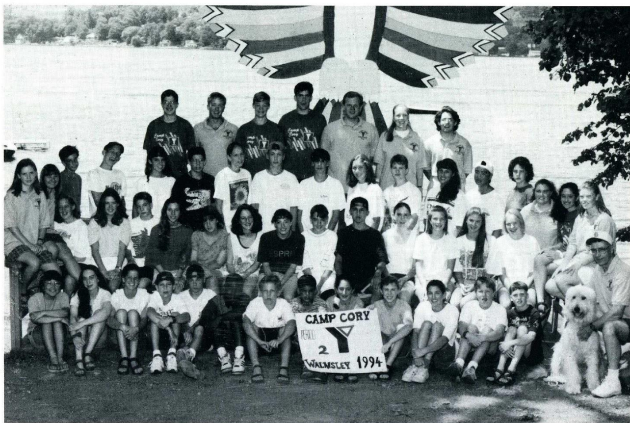
WALMSLEY VILLAGE PERIOD 2