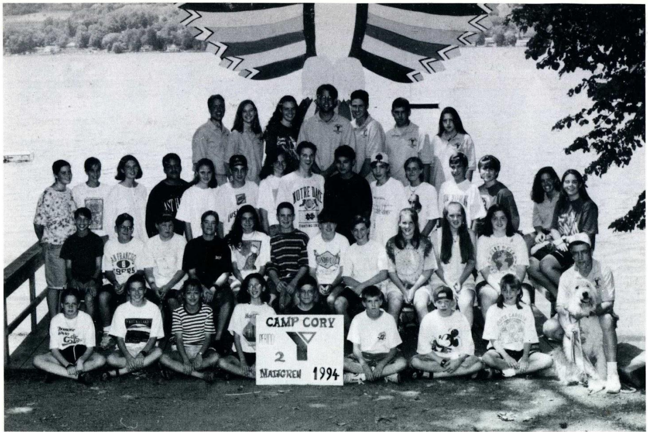
MAIJGREN VILLAGE PERIOD 2