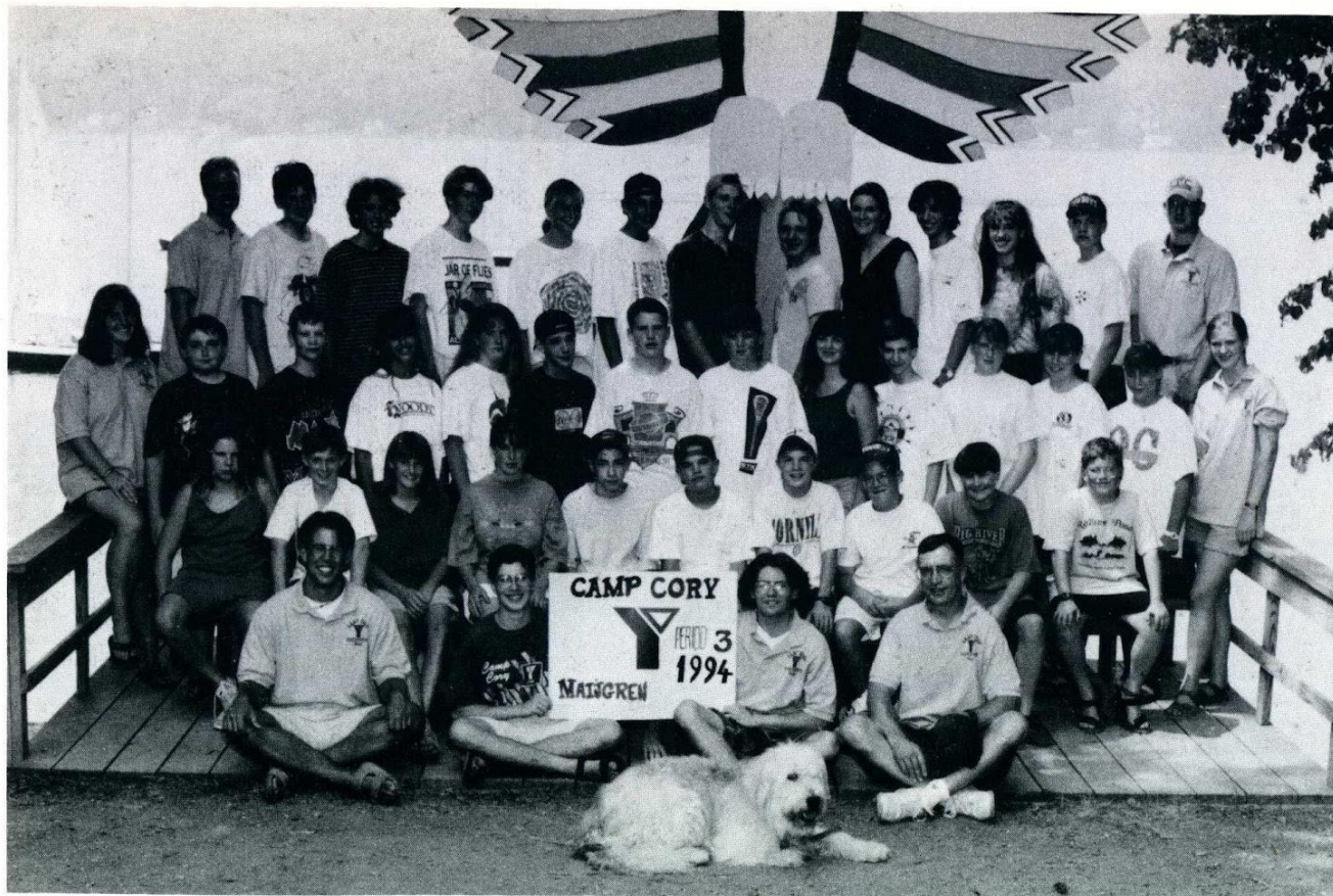
MAIJGREN VILLAGE PERIOD 3