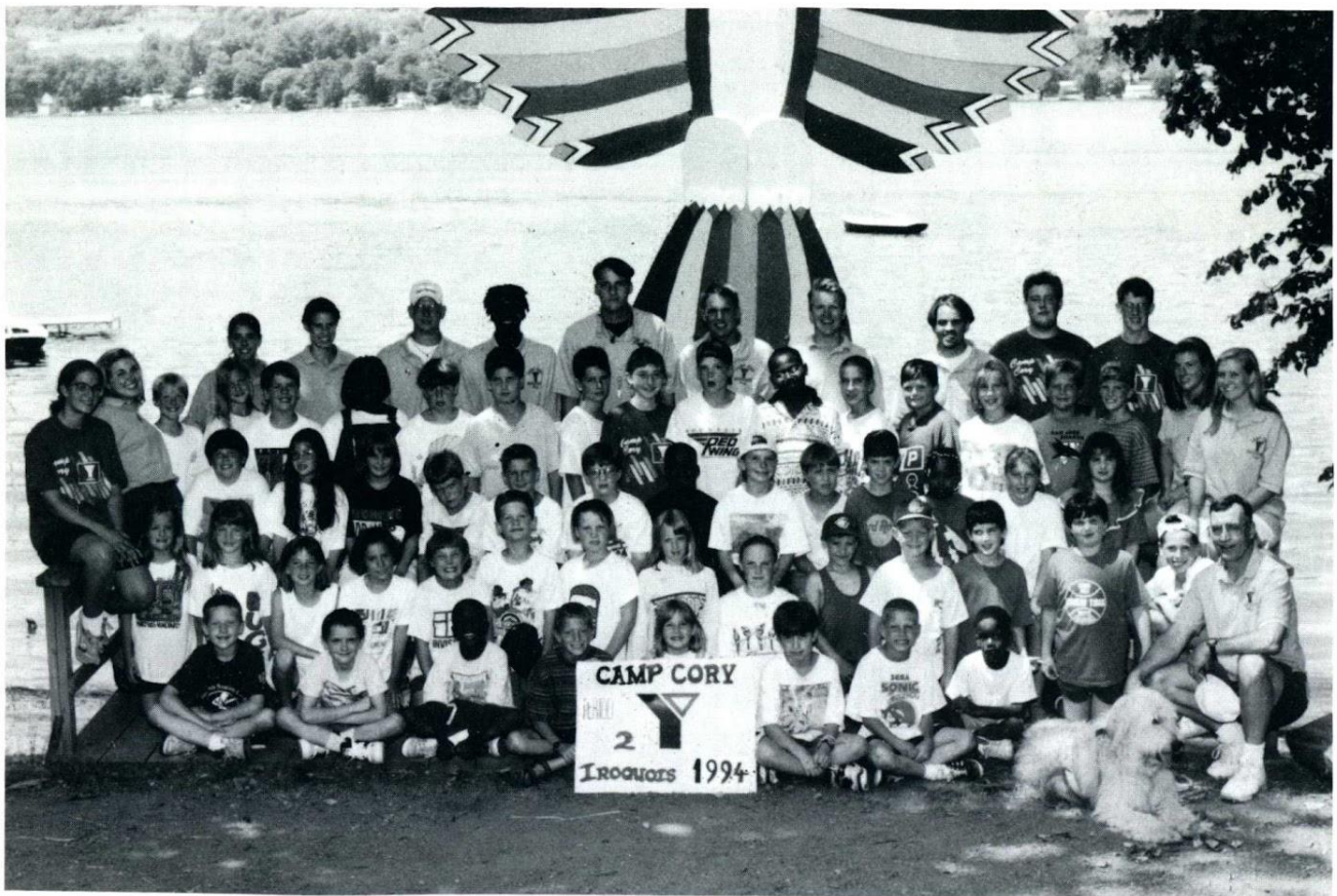
IROQUOIS VILLAGE PERIOD 2