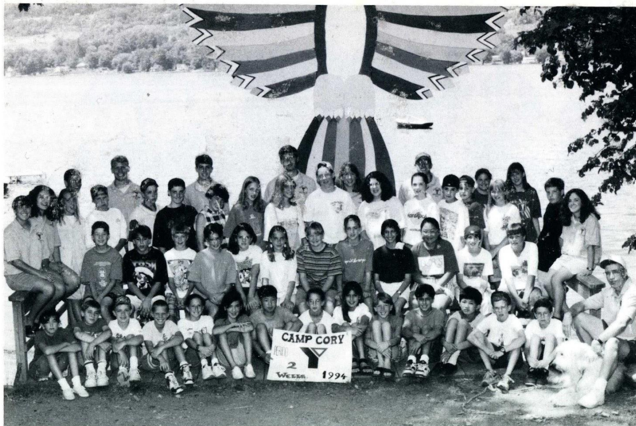
WELLS VILLAGE PERIOD 2