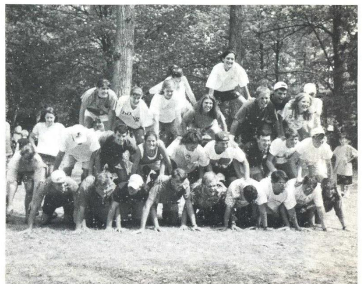
STAFF PYRAMID CAMP CORY