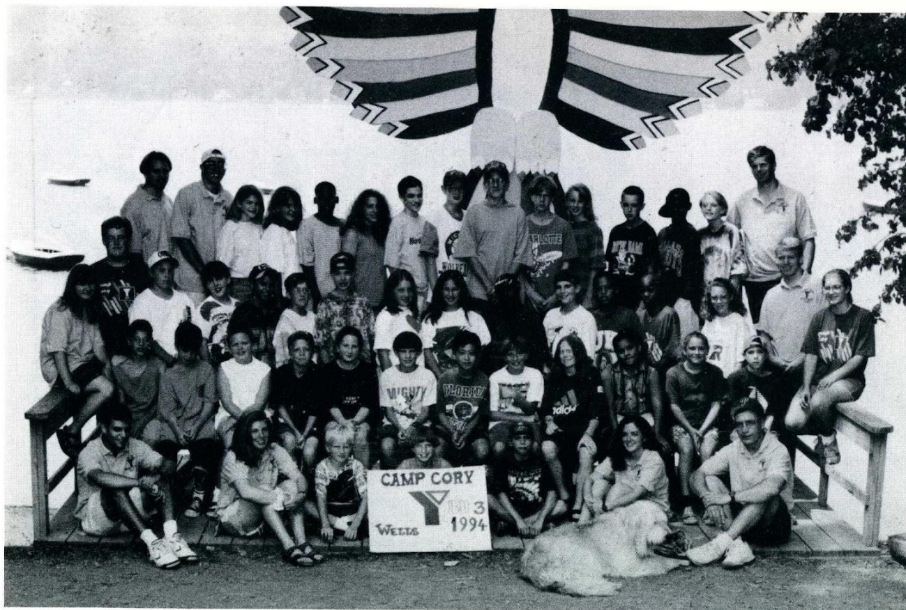
WELLS VILLAGE PERIOD 3