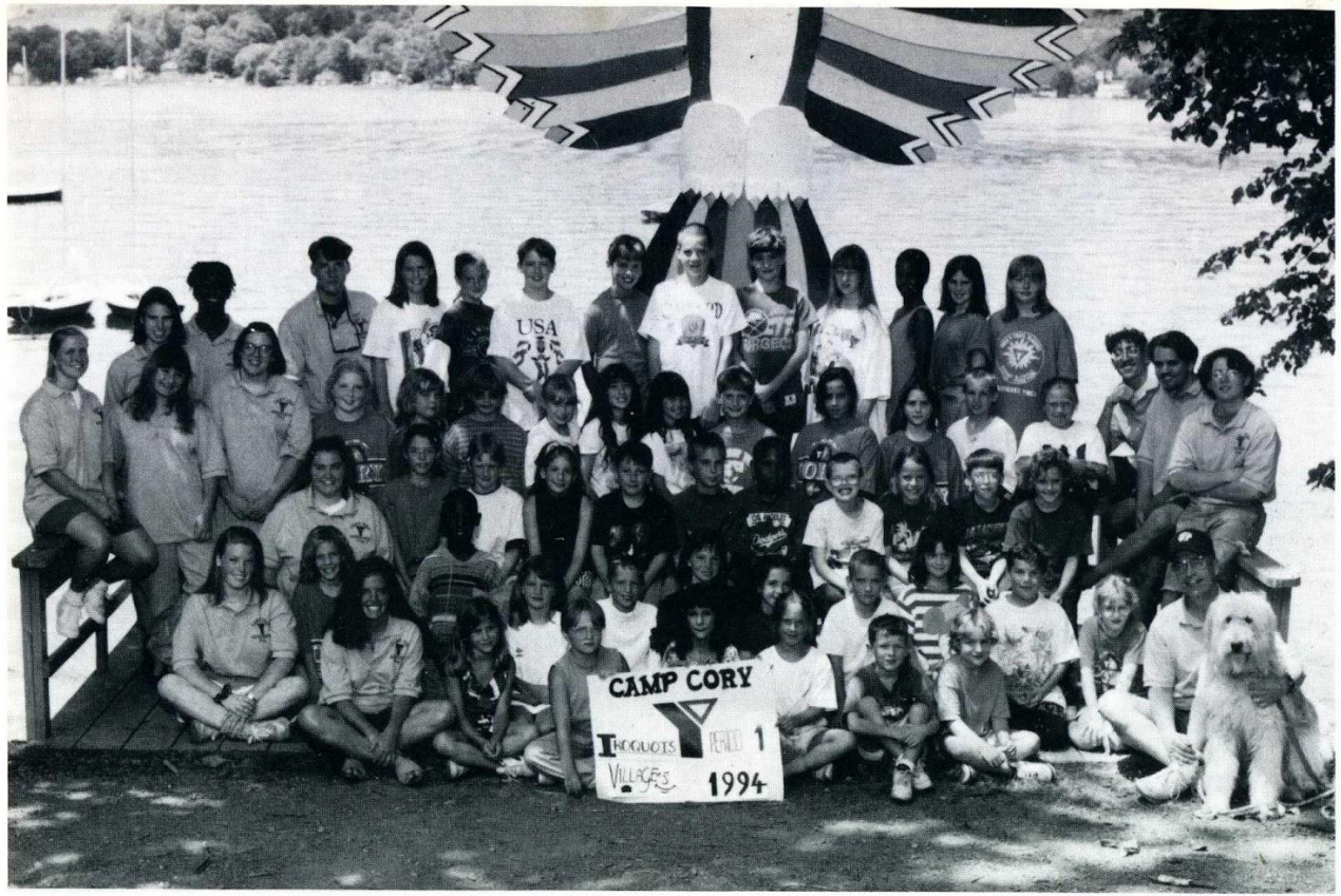
IROQUOIS VILLAGE PERIOD 1