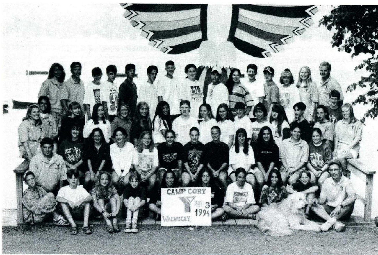
WALMSLEY VILLAGE PERIOD 3