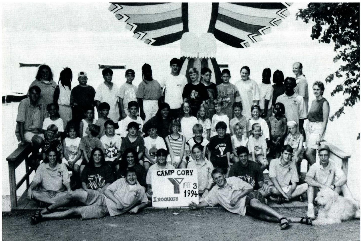
IROQUOIS VILLAGE PERIOD 3