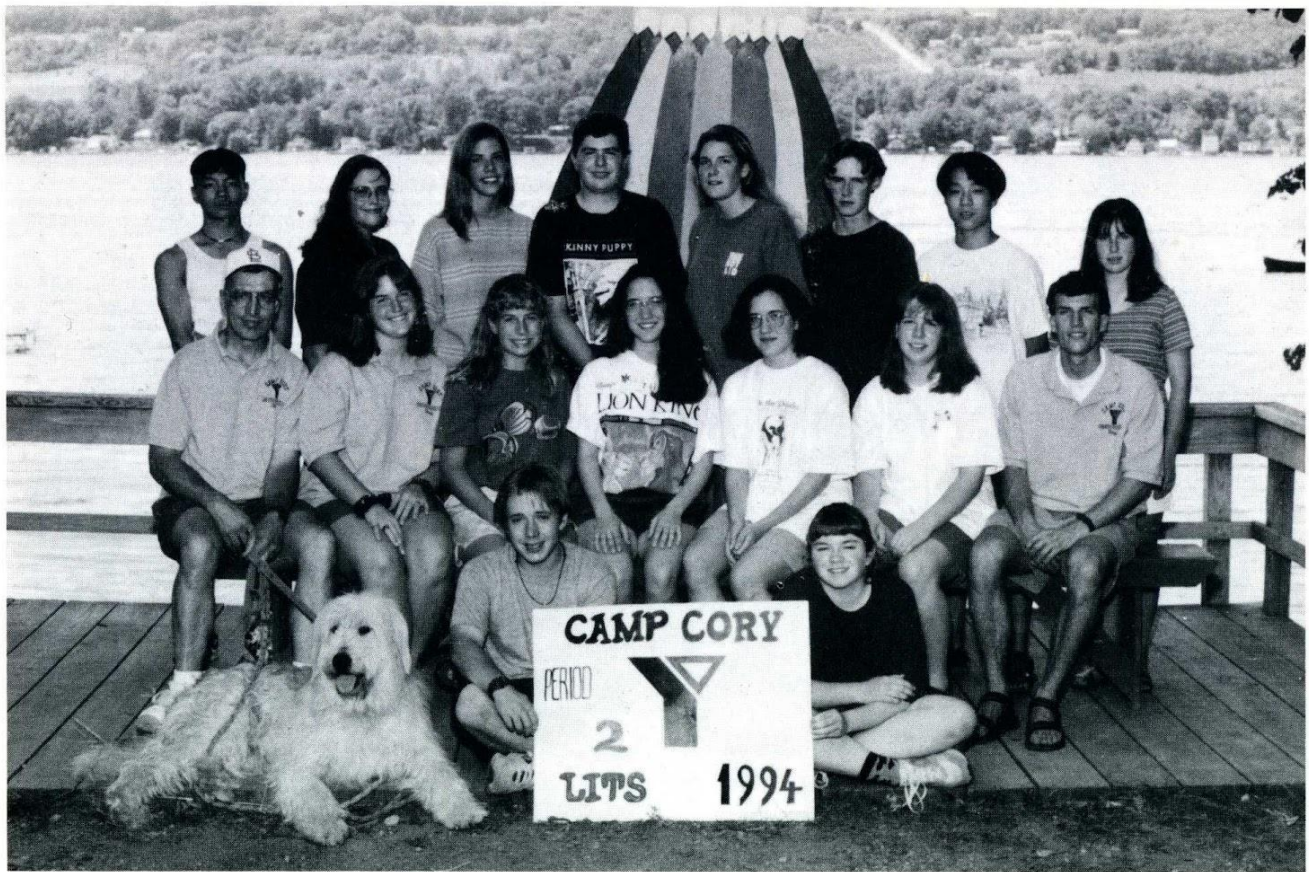
LITS PERIOD 2