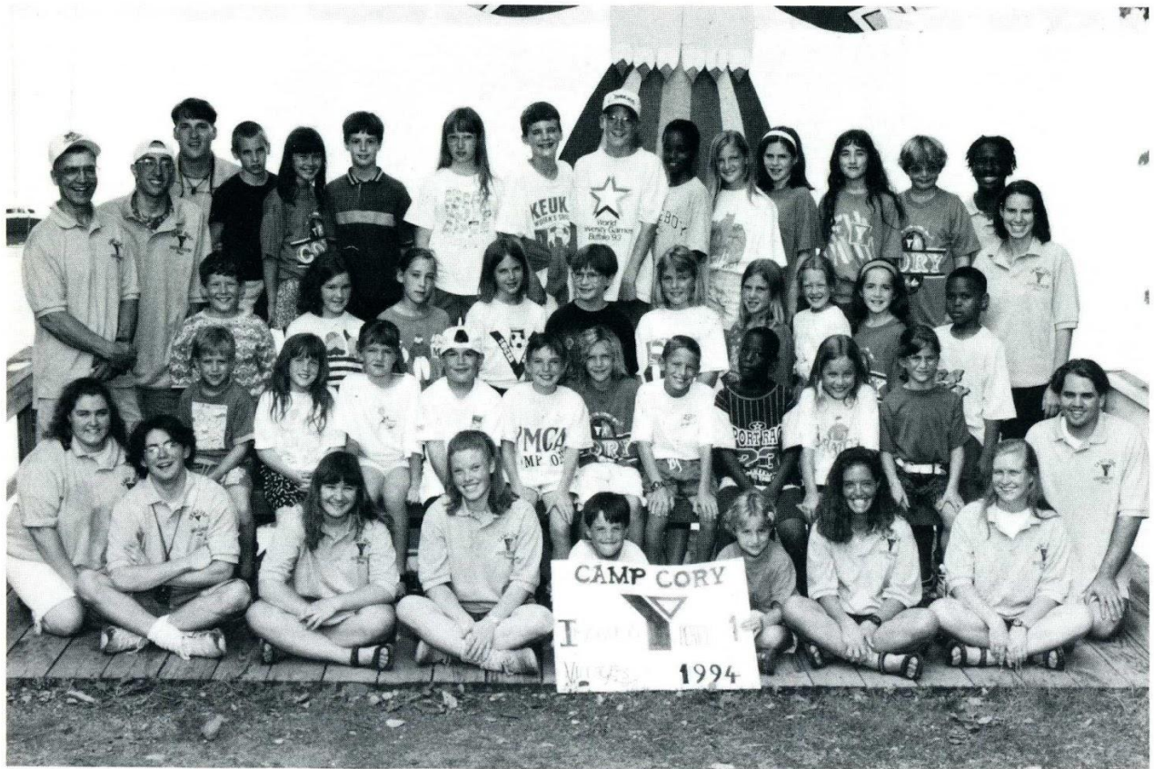
IROQUOIS VILLAGE PERIOD 1