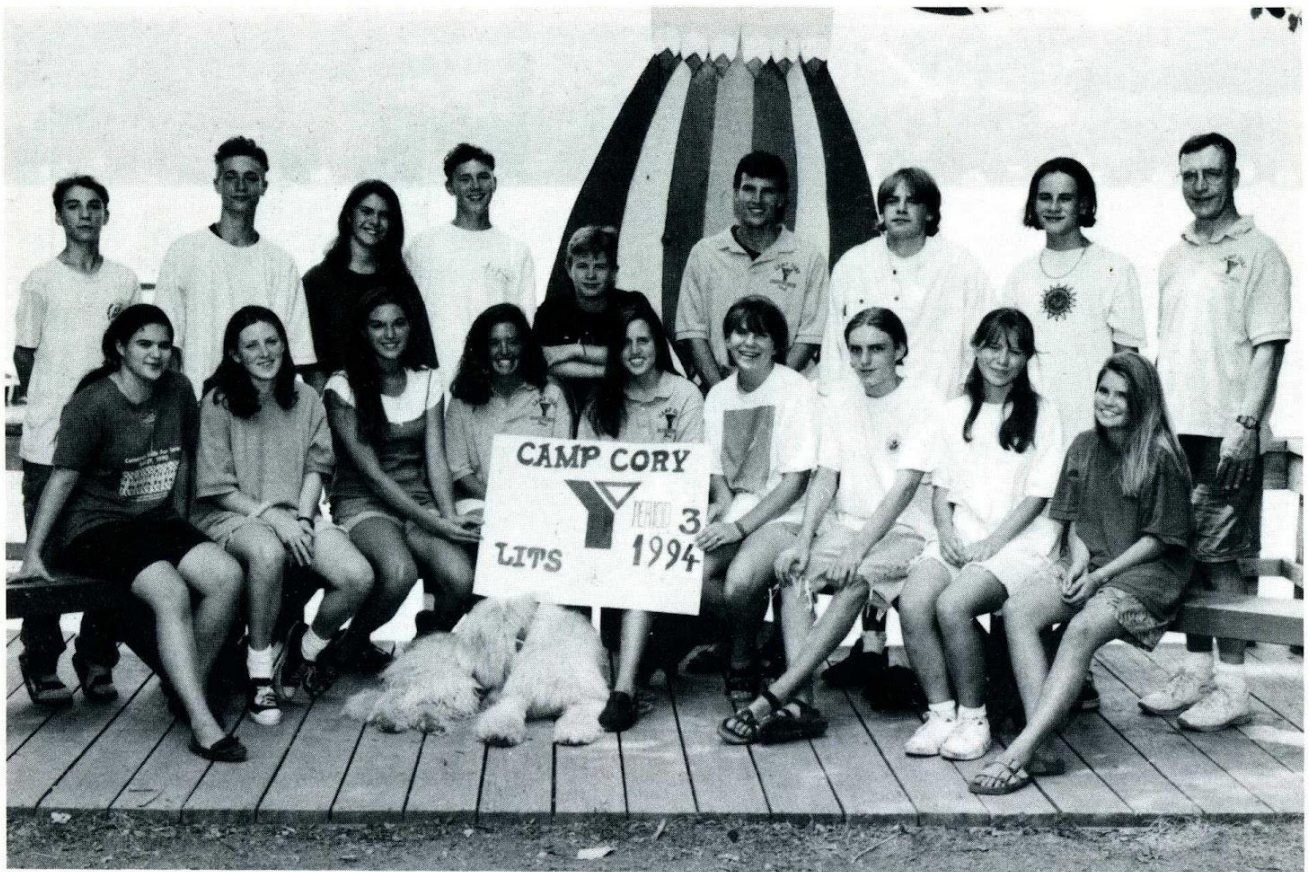
LITS PERIOD 3