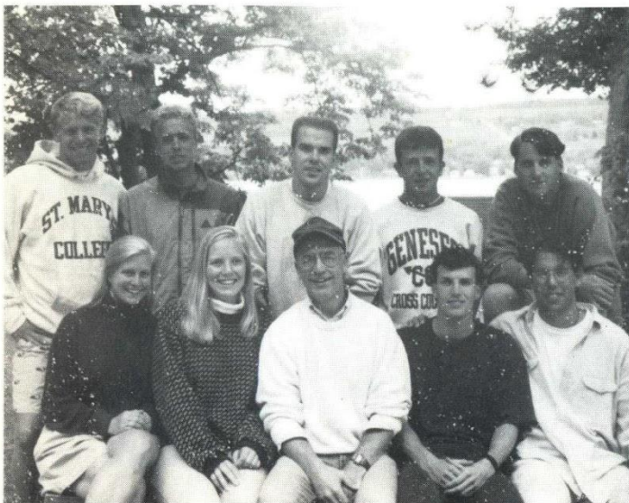
STAFF LEADERSHIP CAMP CORY