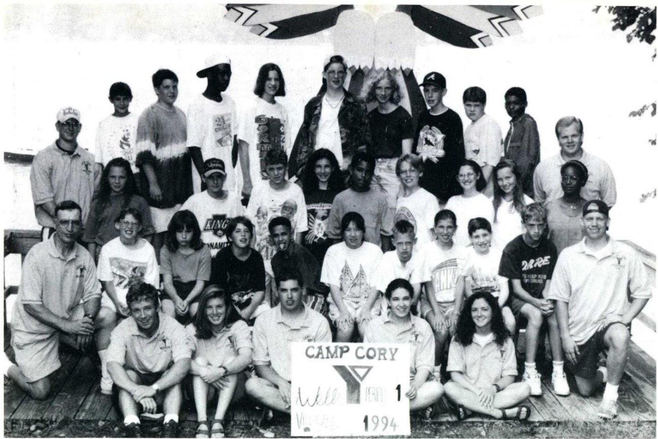
WELLS VILLAGE PERIOD 1