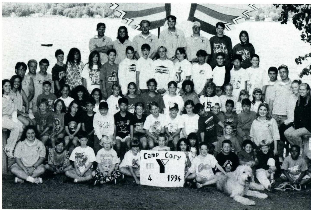
CAMP CORY PERIOD 4