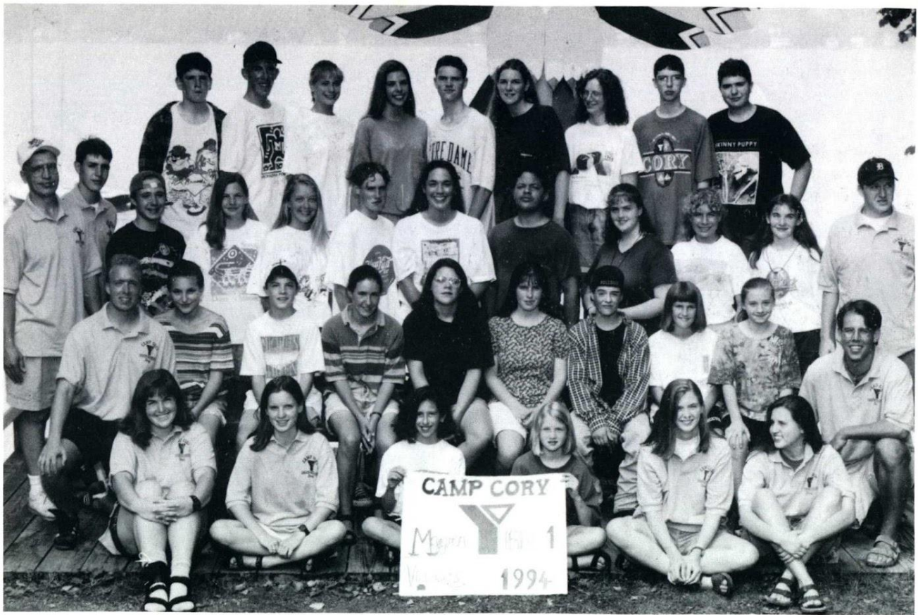
MAIJGREN VILLAGE PERIOD 1