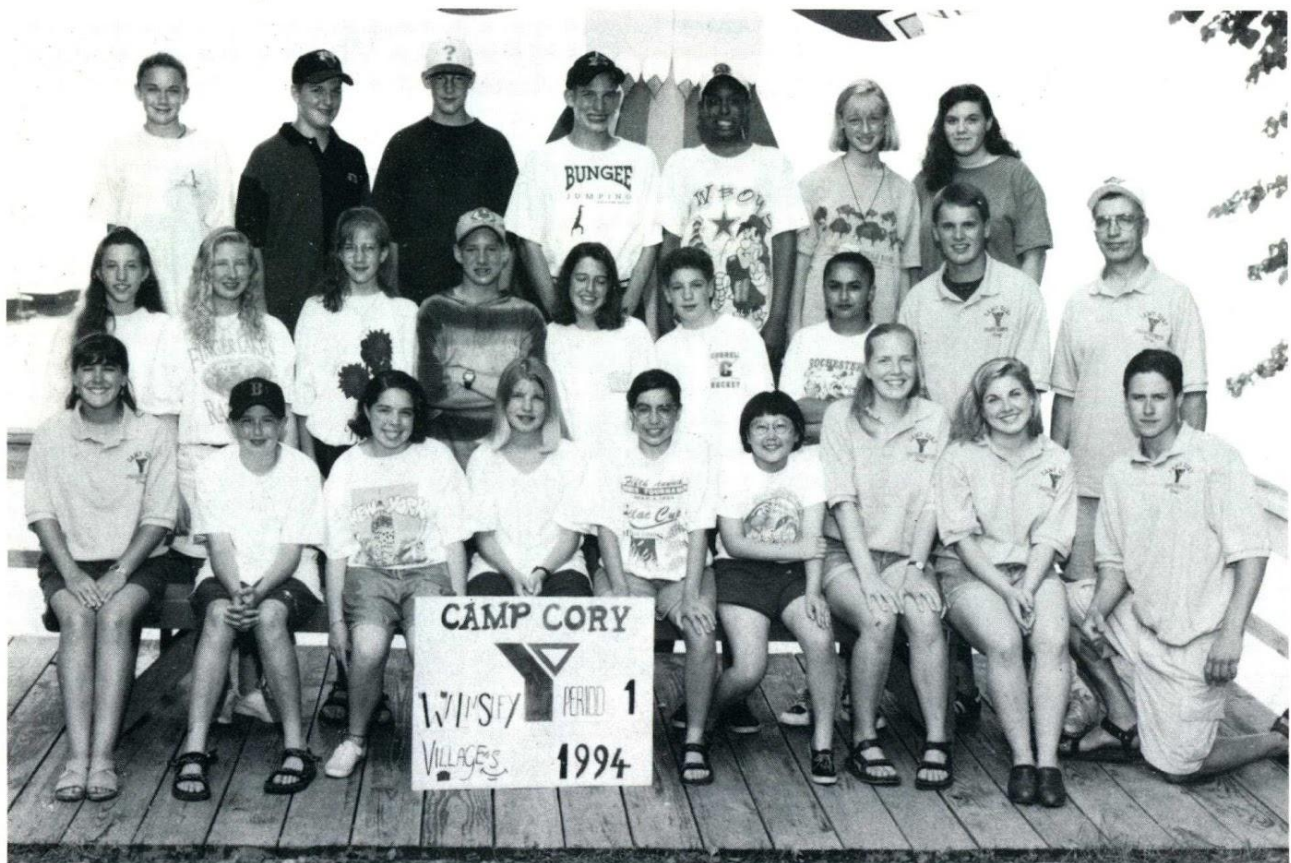
WALMSLEY VILLAGE PERIOD 1