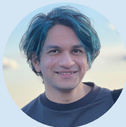
Tushar United States