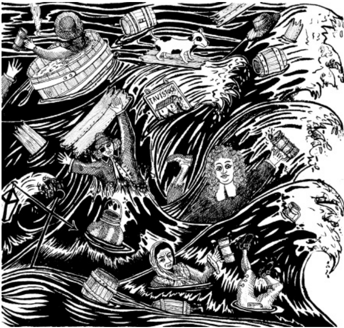
The flood as depicted in a 19th century engraving. From Historic UK's The London Beer Flood of 1914 .