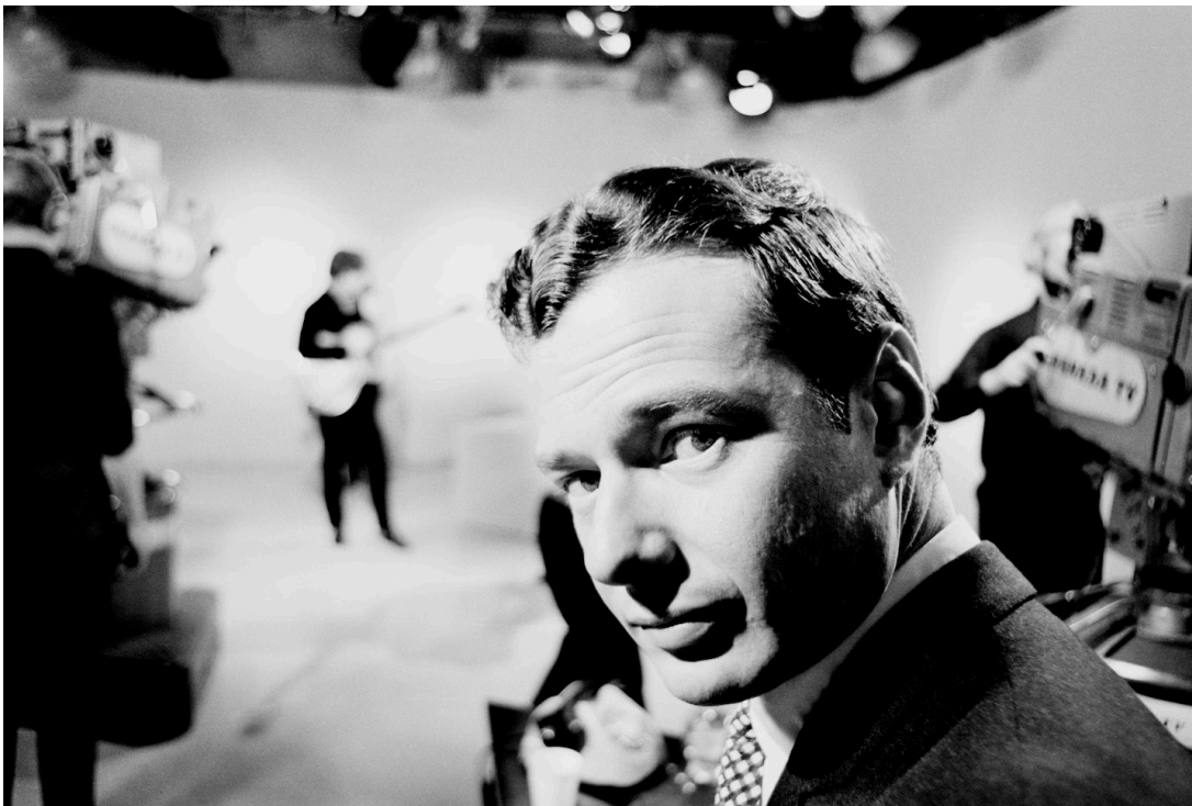
from the Washington