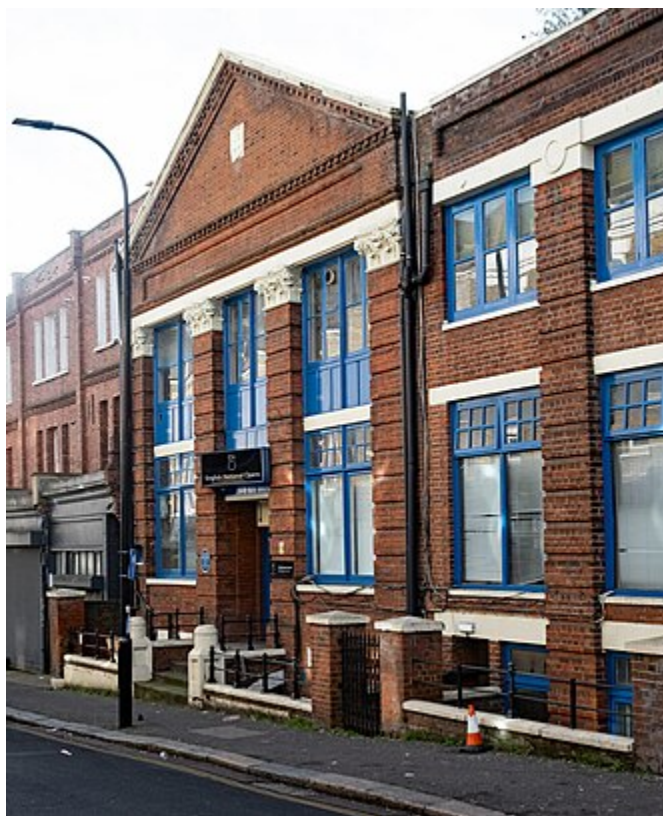
Decca's former recording studio, in West Hampstead, site of the Beatles' audition.