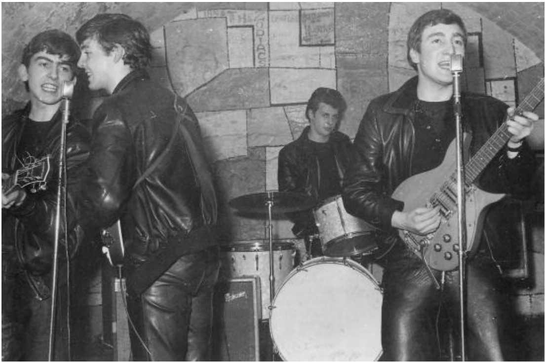
John, Paul, George, and Pete at the Cavern Club.