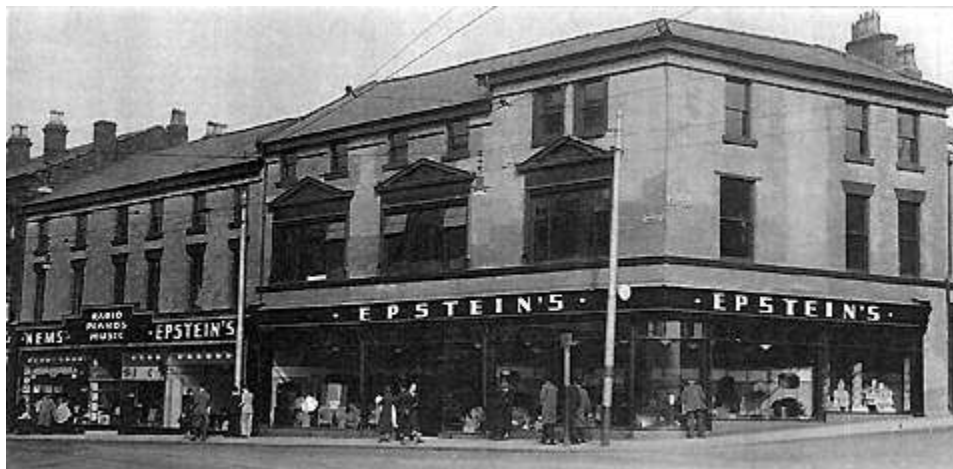
The Epsteins' store.