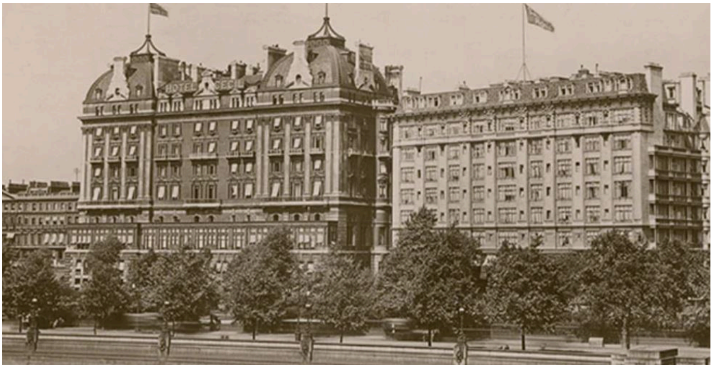
The Savoy opened in 1889.