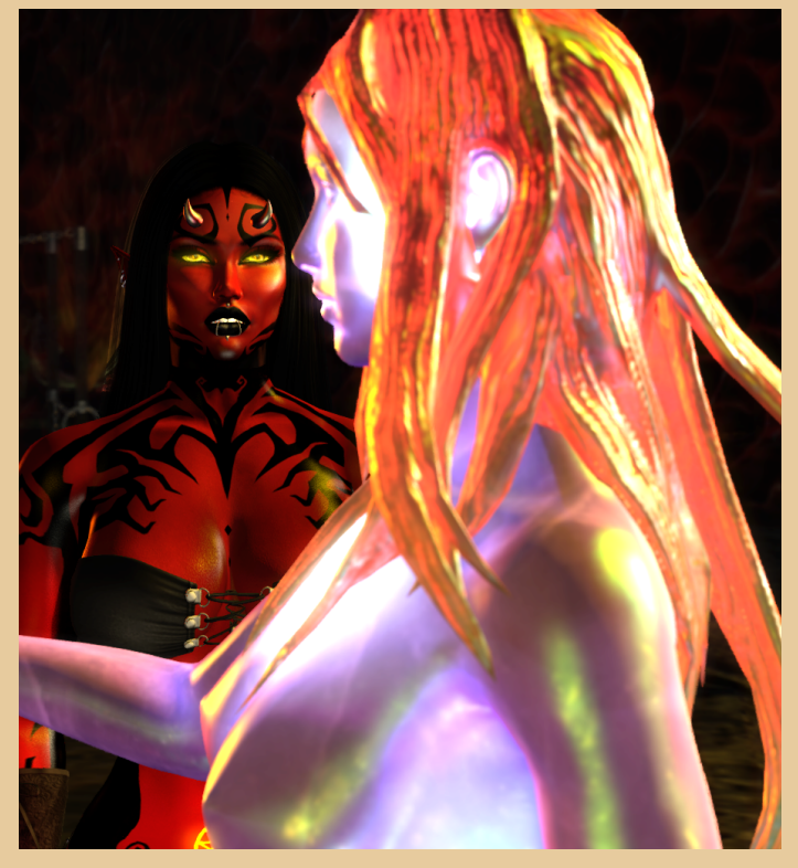
Mistress Nuxta discovers Lady Jadu encased in ice and vows to do whatever it takes to free her dear friend.