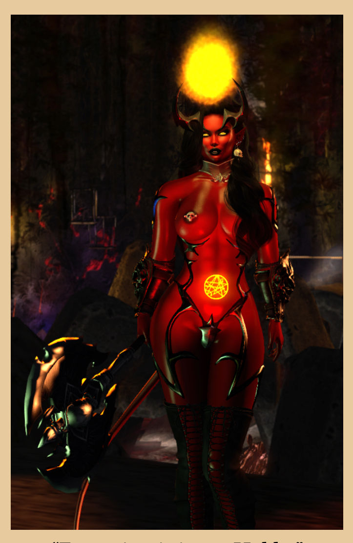
"Execution is just a Hobby"