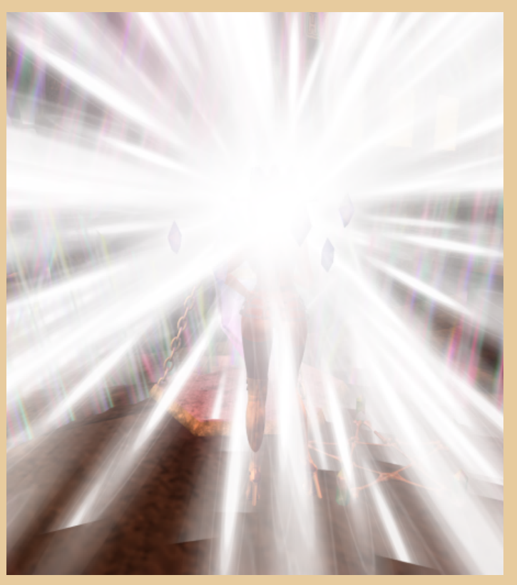
The Crystal activates in a brilliant bust of light when Lady Jadu accidently moves near it.