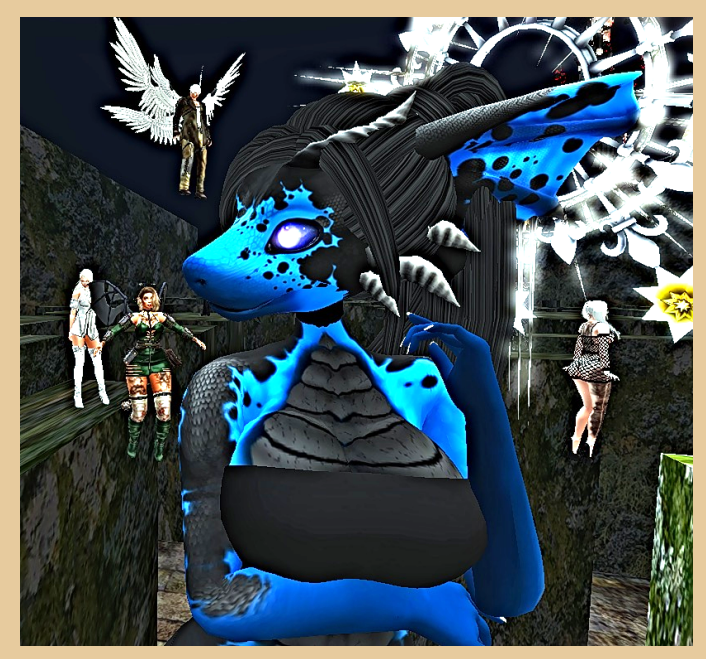
A massive Sharry has been seen stomping around Hell.

Dante ascends the heavy stone steps to Hell's Courtroom, he pauses outside the heavy steel door, forged with hundreds of tortured souls, Dante shudders as watches a ghostly visage locked in an eternal scream crawl as cross the door's metal frame.