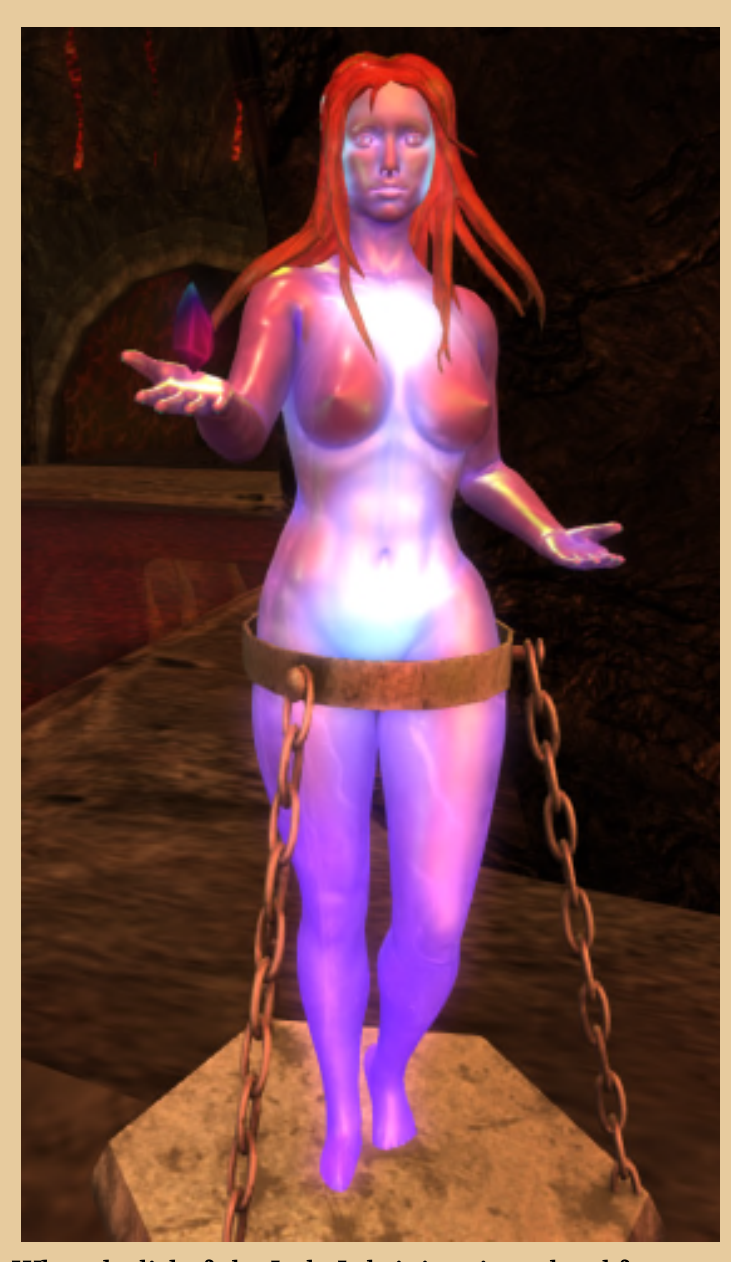
When the light fades Lady Jady is imprisoned and frozen.

Feeling jealous in a relationship can create many problems. It is a toxic and damaging emotion. It is SO important to recognize jealousy and find effective ways of managing it. Communicate gently with your partner and also with yourself. Talking things through can be the most helpful piece to getting rid of jealousy.