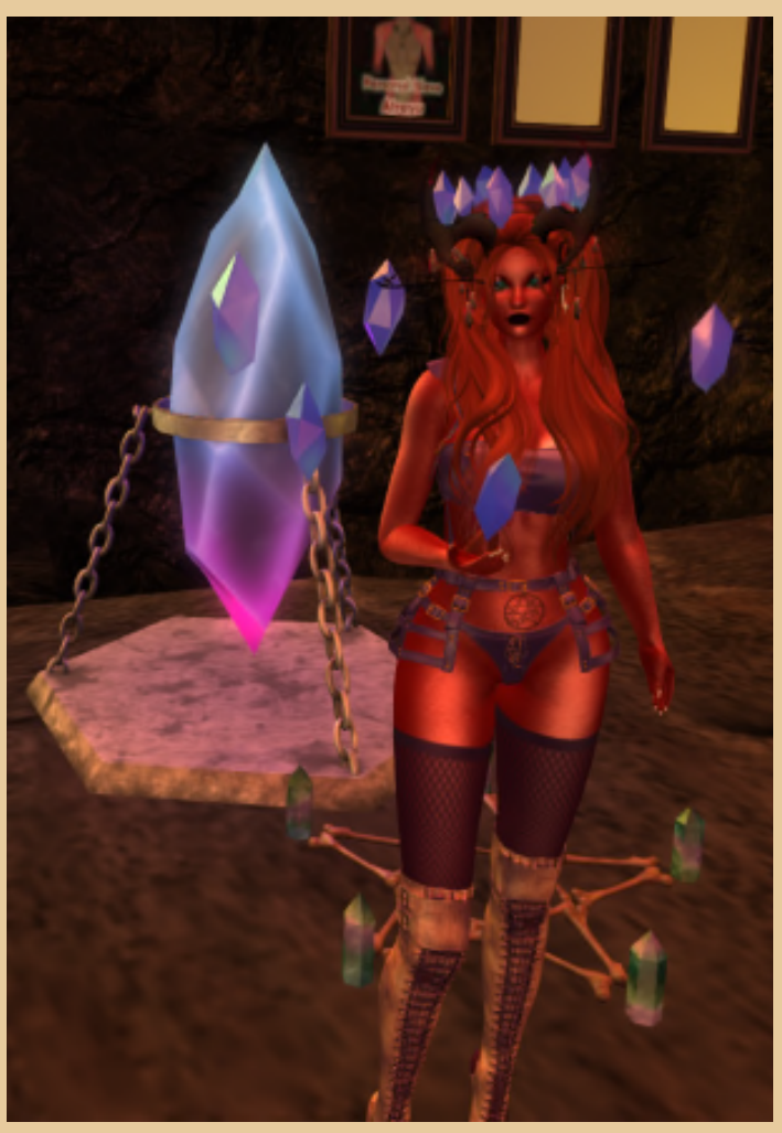
Lady Jadu shows off the crystal stolen from 9th Circle.