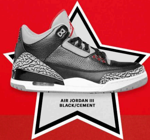
AIR JORDAN III BLACK/CEMENT