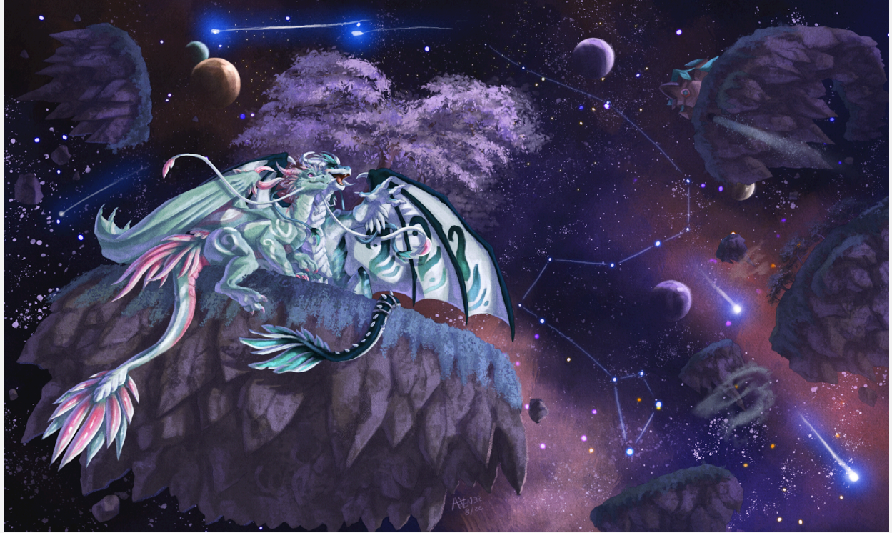
(Artwork by Arven92)