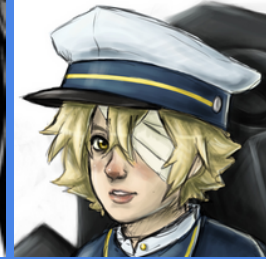
sal fisher ^ | peter pan ^ | izuru kamukura ^ (*) | oliver