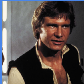
koshi tanaka ^ | chase davenport | sayori ^ | han solo

i really do believe i am these characters. i know that's cringe and i'm sorry.