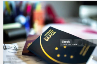
How to open a company in BiH if you are a foreign citizen?