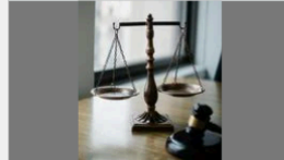
Criminal and misdemeanor law