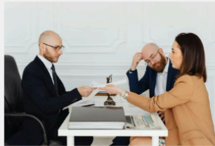
Divorce procedure in Bosnia and Herzegovina