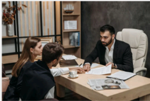
Division of property acquired during marriage in Bosnia and Herzegovina