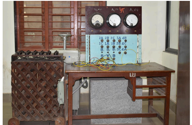
Two Wattmeter Method Panel