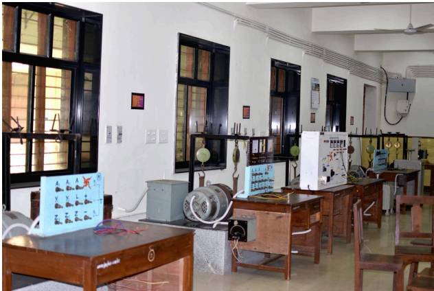
Basic Electrical Engineering lab