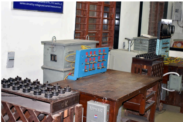
3 Phase Transformer Set